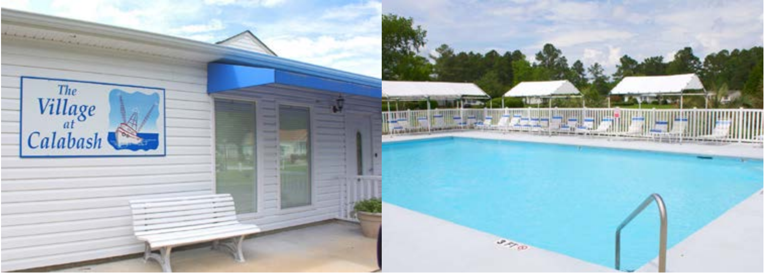
Clubhouse and Community Pool